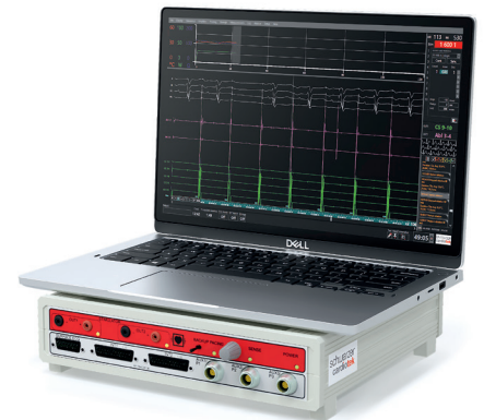
EP-TRACER for CSP Procedures

The new EP-TRACER software release allows you to seamlessly evaluate this in real time or on a triggered view .